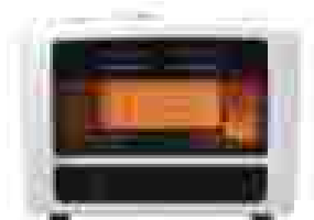
Granada 252 - white