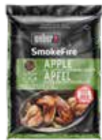
Apple Wood Pellets 190004