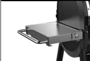
SmokeFire Side Table 7001