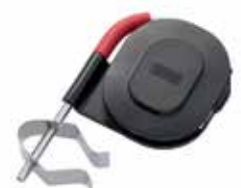
Weber Ambient Probe 7212