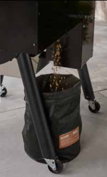
SmokeFire Fuel Bag 7007