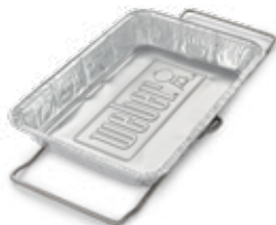
SmokeFire Water Pan 7004