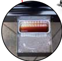
Easy-Clean Ash and Grease System