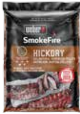
Hickory Wood Pellets 190002