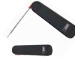
Snapcheck™ Grilling Thermometer Super-fast and accurate to within 1°C. The Snapcheck thermometer is the ultimate instant thermometer. 6752