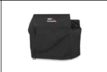
SmokeFire EX6 Cover 7191