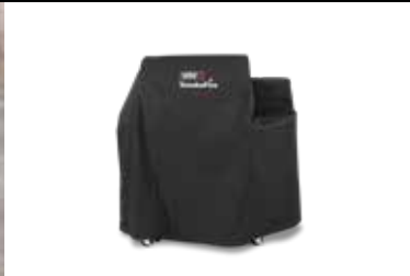
SmokeFire EX4 Cover 7190