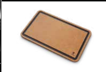
SmokeFire Cutting Board 7005