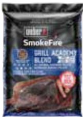
Grill Master Wood Pellets 190001