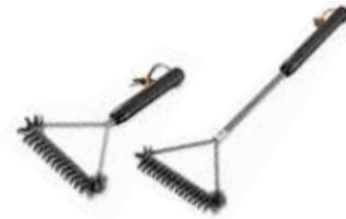
3 Sided Grill Brushes Makes it easy to get between the grill bars and other difficult places. Small 6494 Large 6493