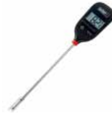
Instant Read Thermometer The large digital display reads the internal meat temperature accurately in a matter of seconds. 6750

For the complete range of Weber accessories visit www.weber.com